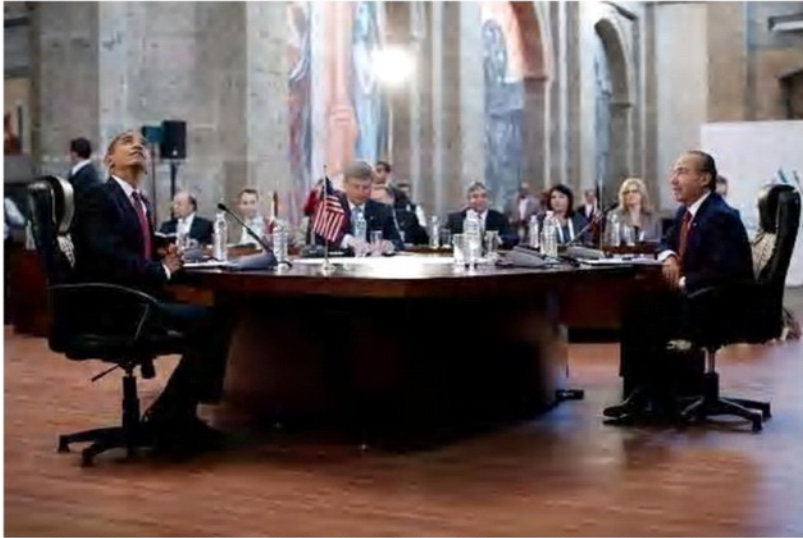
President Obama, left, Mexico's President Felipe Calderon, right, and Canada's Prime Minister Stephen Harper, center, at the leader's trilateral meeting at the Cabanas Cultural Center in Guadalajara, Mexico, Aug. 10

The refocusing resulted from a think-tank analysis that argued the trilateral bureaucratic working groups created under SPP did not pursue enough "big picture" agenda items to make a positive public relations impact on the national voters in the United States, Mexico and Canada.